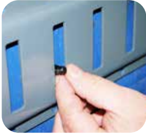
INSTALL STUD PLATE INTO "A" LOGISTIC TRACK/POST