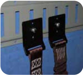
INSTALL STRAP END PLATES TO STUD WITH LOCK NUT (SUPPLIED). TIGHTEN TO 15-17 FT LBS. DO NOT USE IMPACT WRENCH

FOR HORIZONTAL LOGISTIC TRACK, INSTALL THE SPECIFIED STRAP END PLATES TO THE TRACK WITH ONE PLATE MOUNTED DIRECTLY NEXT TO THE OTHER PLATE.