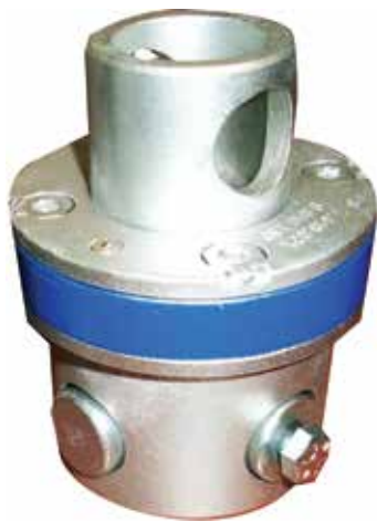
49723-10 Weight: 3.5 lbs