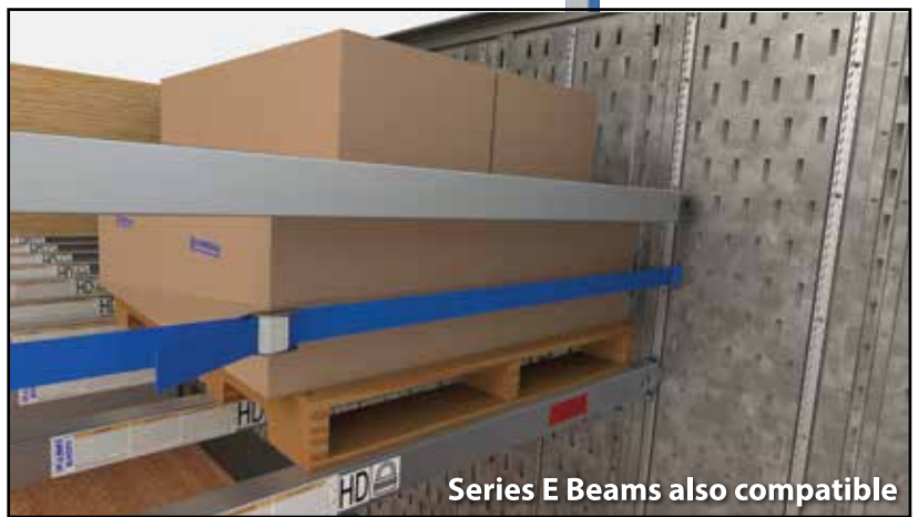
Series E Beams also compatible